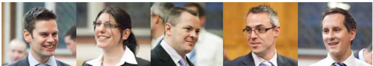
Future Leaders programme delegates